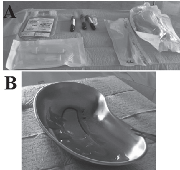
Figure 1. PRP kit (A), PRP Gel (B)

At first it is necessary a proper request to the transfusion center; the Nurses pick up the PRP kit composed by a Platelet, an infusion set, three serum tubes with thrombin (Figure 1A).