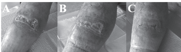
Figure 3. Evolution of injury: day 0 (A), 2-week follow-up (B), final 4-week follow-up (C)

The third case is a wide wound of the forearm in a young man after a car accident. The patient sustained fracture of the proximal ulna with soft tissue loss. The lesion was followed by an initial compartment syndrome. After 19 days the wound was dry with regular edges and initial presence of granular tissue at the bottom so we decided for PRP application (Figure 4A). At two weeks check-up the lesion was red-colored with well-defined edges and reduced limb edema (Figure 4B). After physiological saline cleaning, we had to apply low adhesion gauze and zinc paste bandage in order to reduce excessive granulation. About 45 days after trauma the patient had bacterial infection of the