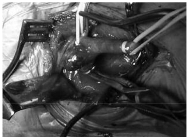
Figure 3. Intraoperative view: wide-necked, saccular, "diverticulum like" aneurysm at the origin of the right ICA

Due to the unusual saccular, wide-necked, "diverticulum-like" shape of the aneurysm, we performed an