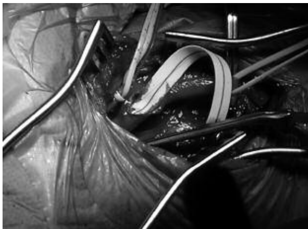
Figure 4. Intraoperative view: aneurysmectomy with Dacron-patch closure

One month, 6 months and 1 year Duplex Scan follow-ups were performed which showed patency of the carotid axis with regular blood flow. The patient appeared asymptomatic.