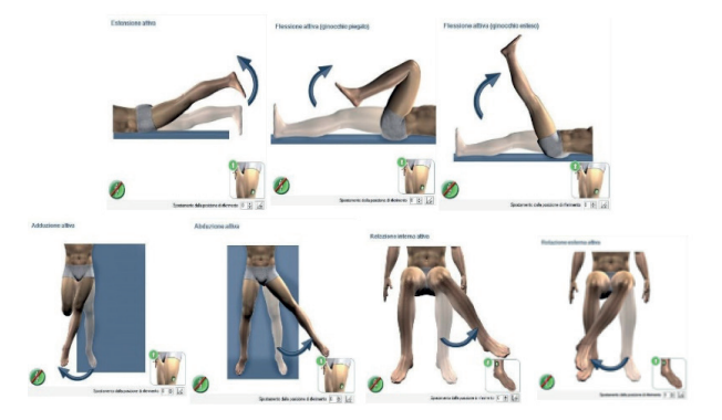
Figure 2. Representation of the articular movement recording

The average of the "VAS" score, the "WOMAC" score and the articular analysis was calculated for each evaluation, then was calculated the difference between the three averages in the different stages of evaluation.