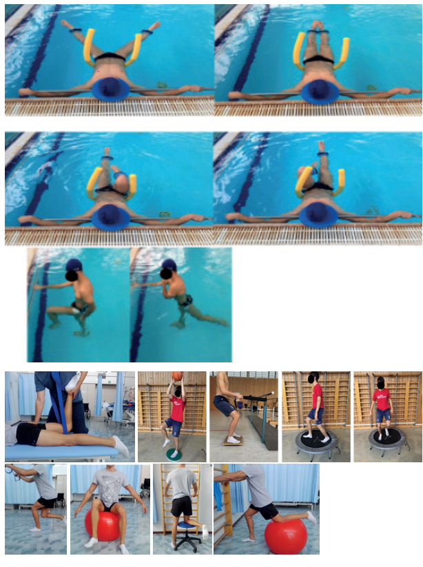
Figure 3. Explanatory pictures