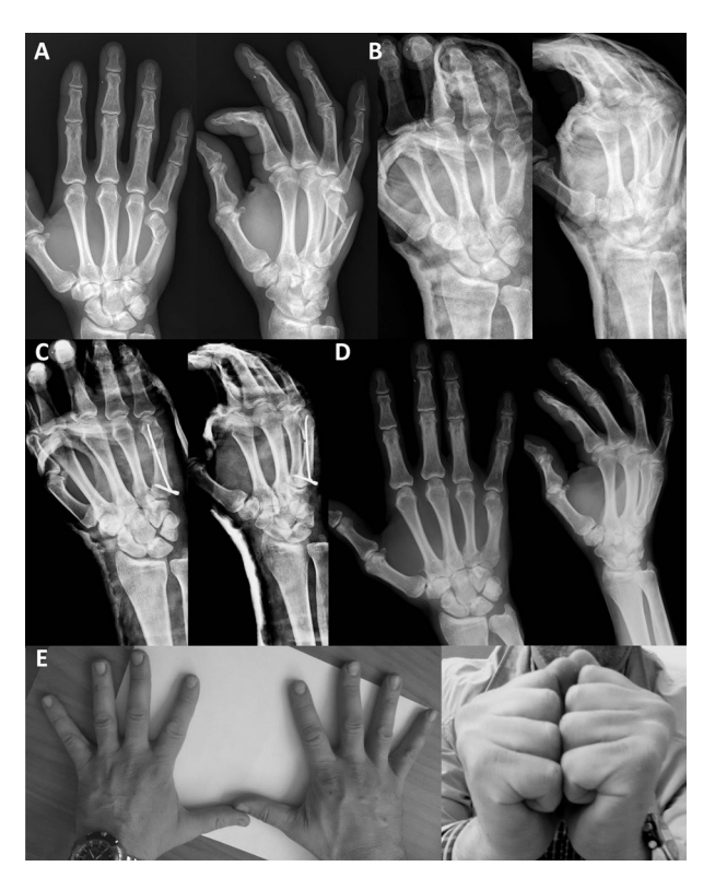
Figure 2. Fifth metacarpal neck fracture of the right hand with fragmentation of the volar cortex. Preoperative radiographs (A) and x-rays after closed reduction and application of a splint (unsatisfactory result) (B). Postoperative views (C) and after removal of the nail (D). Satisfactory clinical outcome (E).

The majority of boxer's fractures are isolated injuries, simple, closed, stable and are treated conservatively (1, 3, 6, 8). Cosmetic and functional losses may occur in cases where appropriate reduction and orthotic stabilization are not achieved (8, 10). The management of these limited cases is still a matter of debate (1, 3, 6, 8, 12). Indications for operative treatment include malrotation, longitudinal shortening and excessive angulation of the head. Although the majority of surgeons agree that a shortening of the metacarpus by more than 3 mm and any rotation deformity is poorly tolerated and needs correction, it remains controversial how much angulation can be tolerated without loss of