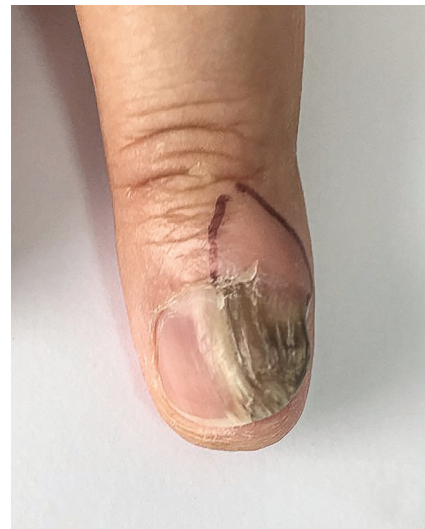
Figure 1. Onychomatricoma. Clinical image. Lateral, hyperkeratotic nail thickening, with increased transverse curvature. Highlights an intense pigmentation of the nail plaque.

We present the case of a 62-year-old male patient with a history of non-Hodgkin lymphoma treated six years ago and a melanoma in a first-degree relative. He presented a 2-year history of progressive deformation of the nail plate in the middle finger of the left hand, with thickening, discoloration, and hyperpigmentation. He had previously received empirical treatment with oral terbinafine for two months, without improvement. On physical examination, he presented a hard, thickened, highly hyperpigmented nail plate, with lateral deformation and hyperkeratosis, affecting from the nail matrix to the distal free edge of the nail plate (Fig. 1). Direct microscopic examination and fungal culture were negative for fungal infection. Ultrasonographic analysis (8 to 18 MHz multi-frequency linear compact transducer, General Electric Logic E9 XD Clear, General Electric Health Systems, Waukesha, WI), showed a subungual solid hypoechoic structure (1.5 cm x 0.8 cm x 0.5 cm) with hyperechoic lines that involved the proximal segment of the nail bed, including the ulnar wing of the nail matrix, and protruded into the interplate space. Thickening and upward of the nail plate