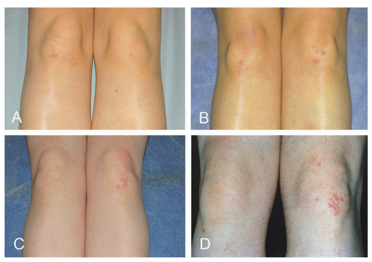
Fig. 1. Papular sarcoidosis of the knees. A, B, Multiple erythematous-brownish papules grouped on both knees of two female patients with systemic sarcoidosis. C, Granulomatous-appearing papules limited to the left knee in a female patient with systemic sarcoidosis. D, Papules with linear arrangement limited to the left knee of a male patient without confirmed systemic sarcoidosis

had EN. Three patients had recurrent outbreaks of their papular lesions of the knees. The papules persisted a median time of 6.93 months.